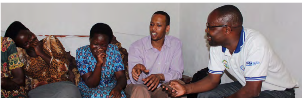
(Left) Huguka Dukore and Souktel interview youth to assess their level of internet and technology access