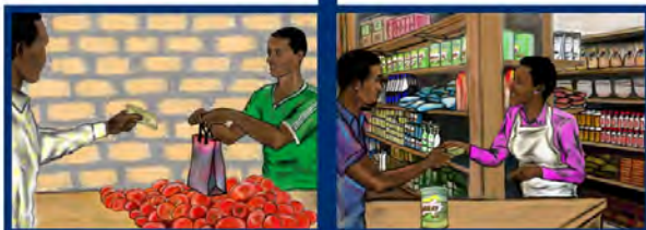
Business Start Up, Grow your own Business and Business Development Services