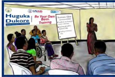
Be Your Own Boss Training