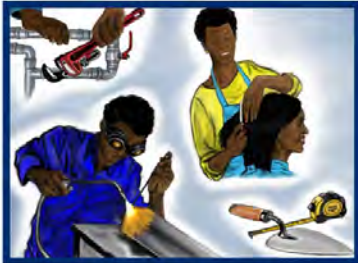
Technical Training Options