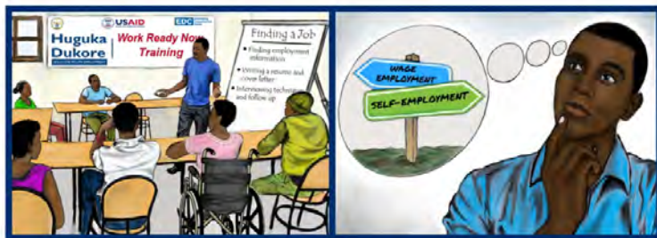
Work Ready Now! Training, Work Based Learning, Personal Development Plan