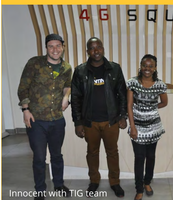
Innocent with TIG team

In support of Huguka Dukore's objective to develop a digital networking and data driven communication platform with and for project stakeholders, consortium partner TIG conducted a preliminary needs assessment to map out youth access to digital tools and platforms. The assessment determined that many rural and even peri-urban youth do not have basic computer literacy skills required to access a potential web portal designed by the project. Huguka Dukore will focus on adding digital literacy curriculum components and outreach via social media, ensuring youth engagement for all youth. Huguka Dukore began coordinating with DOT Rwanda's new, large scale Digital Ambassadors Program to identify potential computer literacy training support for Huguka Dukore