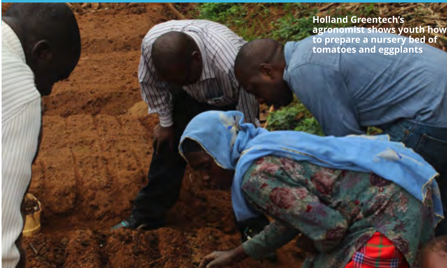
Holland Greentech's agronomist shows youth how to prepare a nursery bed of tomatoes and eggplants

Huguka Dukore consortium member Connexus made significant progress during FY17 developing partnership agreements with private sector agriculture companies. These included MOUs with Holland Green Tech, Balton Rwanda, AgroTech, PEBEC and Garden Fresh. Collectively, these agreements represent anticipated technical trainings for more than 500 youth and agribusiness jobs for more than 300 youth, to be expanded to more youth during FY18.