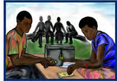
Saving and Internal Lending Communities